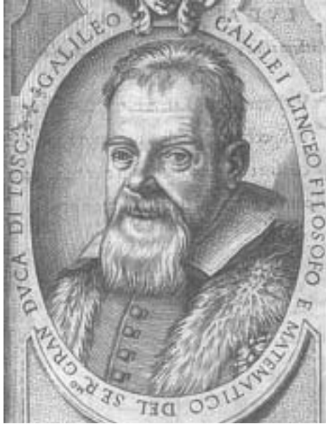
Fig. 4: Galileo Galilei, from his 1613 book on sunspots.

But meanwhile, toward the end of 1610, Galileo made another discovery that bore directly on the viability of the Ptolemaic system. In the Ptolemaic arrangement, the epicycle of Venus always lay between the earth and then sun, so if the planet shone by reflected sunlight, it could never show a full phase. By late December Galileo had confirmed that 'the mother of loves' (as he encoded her) displayed the entire gamut of phases from full to crescent, and therefore