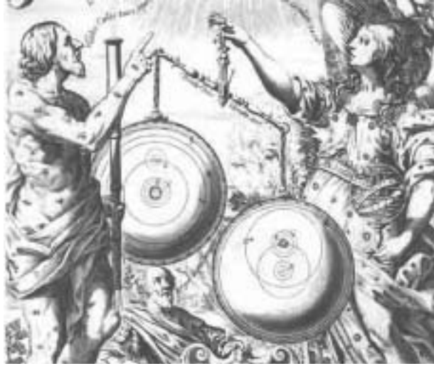
Fig. 2: Tycho's system outweighs Copernicus' heliocentric arrangement in this detail from the frontispiece from Giambattista Riccioli's Almagestum novum (Bologna, 1651) (author's collection).

this book', Osiander wrote (and I paraphrase). 'But not to worry. It is the astronomer's task to make careful observations, and then form hypotheses so that the positions of the planets can be calculated for any time. But these hypotheses need not be true not even probable. A philosopher will seek after truth, but an astronomer will just take what is simplest. And neither will find truth unless it has been divinely revealed to him.' 5