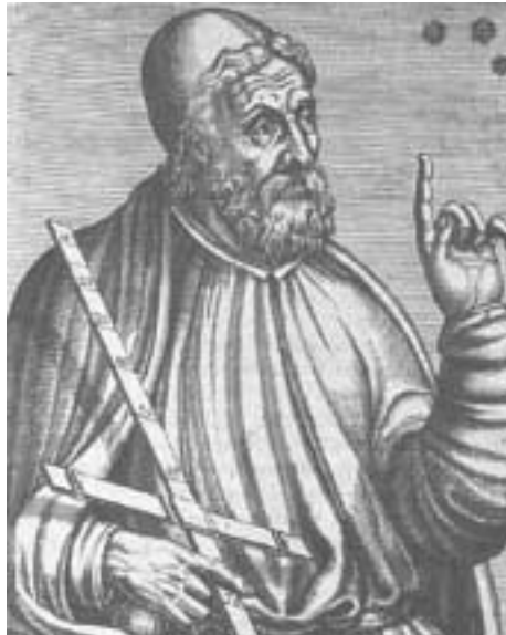
Fig. 3: An imagined portrait of Claudius Ptolemy from Andre Thevet, Vrais portraits et vies des hommes illustres (Paris, 1584).

to correct for differential refraction of the earth's atmosphere. As it subsequently worked out, his refraction table had an error exactly equal to the effect he was seeking, which led to a spurious result for the distance to Mars. Believing that he had proved that Mars came closer than the sun, he then declared against the Ptolemaic arrangement. Interestingly, however, he did not endorse the Copernican system, but rather, he adopted his own geo-heliocentric scheme. In the Tychoonic system the earth remained fixed in the centre of the cosmos, with the two great luminaries cycling around it. In turn, the sun carried a retinue of planets around it. These were spaced with intervals exactly as in the Copernican system, except that the fixed earth broke the pattern, as may be seen in the detail from the frontispiece of Riccioli's Almagestum novum .