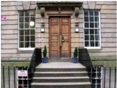
St. John's College